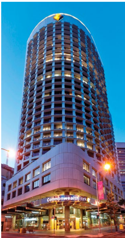
Commonwealth Bank, Brisbane

In essence, the use of galvanizing should not be at the expense of this basic quality and integrity of the concrete. In this way, the galvanizing can be considered to provide protection against those circumstances that may lead to premature corrosion of conventional reinforcement and deterioration of the concrete mass.