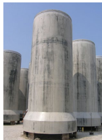
Example of HDG reinforcement used in the construction of sewer pipes to prolong life and resist the effects of corrosion

More recently, higher strength reinforcement to 500 MPa yield has been introduced and extensive testing has again verified that the superior mechanical properties of these steels are retained after hot dip galvanizing.