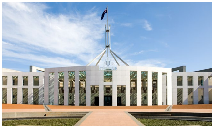
Parliament House, Canberra

Overall, the repair can be easily undertaken by any of these methods and the results, though not as good as the original coating will provide adequate corrosion protection to the previously damaged region. Whenever a repair is undertaken it is important to appropriately clean the exposed metal surface and adjacent region. Further advice on the repair of galvanized steels can be obtained from the GAA.