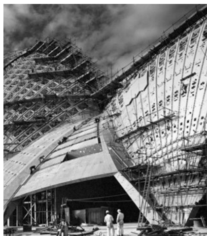
Sydney Opera House under construction

As far as galvanized reinforcement is concerned, there is no effect on either the corrosion resistance or bond capacity if a grey coating is present. The only issue may be that the extra thickness of the coating and the absence of the pure zinc layer may cause some slight flaking during fabrication, but again this is not of concern. It should also be remembered that if galvanizing produces a grey coating this cannot be blamed on the galvanizer for it is the nature of the steel and not the galvanizing process which is the cause.