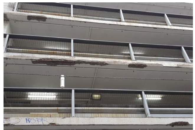
A multi-storey car park suffering from spalled concrete due to corrosion of the rebar

Readership: Academics, government agencies, corporate research centres and architectural and engineering consultancies. Academic staff and research students. Building and construction sector.