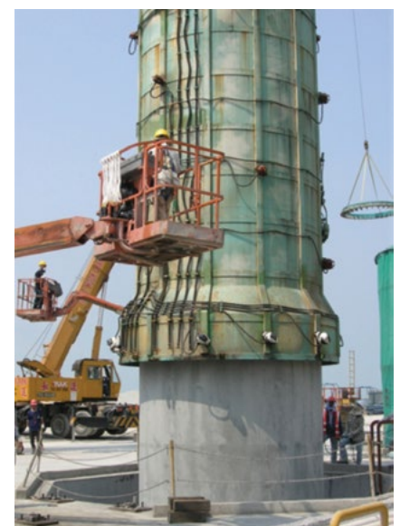
Example of HDG reinforcement used in the construction of sewer pipes to prolong life and resist the effects of corrosion

Further technical detail can be obtained from the Galvanizers Association of Australia or from the literature and websites referred to at the end of this document.