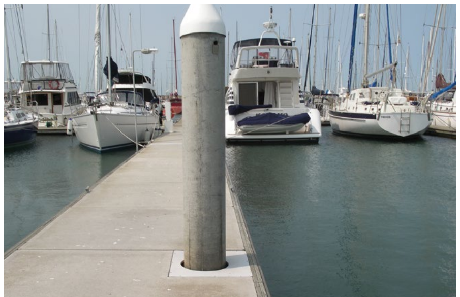
The floating pontoons at this marina at Sandringham, Victoria used galvanized reinforcement

It is also known that the resistance of the galvanized coating to chloride attack depends on the compactness of the passivating surface layer as well as the microstructure of the remaining coating. By the time chlorides reach the reinforcement during the life of the structure, the protective surface layer of calcium hydroxylzincate should have already formed. If this layer is compact and continuous and the remaining coating has a thick enough pure zinc layer to resist pitting attack, the galvanized coating will resist chloride attack quite well.