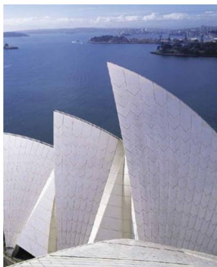
Sydney Opera House

So the question of whether pre- or post-galvanizing is best depends on the circumstances. If it is possible to pre-fabricate and then galvanize this is a good option to follow. Note however that the ability to do this may well be dictated by the capacity of the galvanizing bath, especially so if large complicated pre-fabricated sections are to be coated. This is a matter that needs to be discussed with the galvanizer well in advance with appropriate planning.